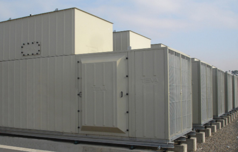
SINCROTRON ALBA CELLS (CERDANYOLA DEL V.)