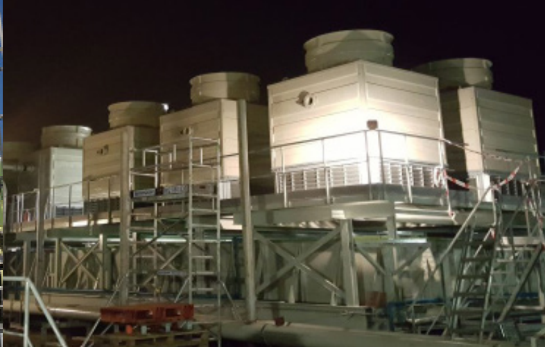
MALL EL CORTE INGLES - (GRAN VIA, BILBAO) AIR CONDITIONING - 12 X 1,050 KW