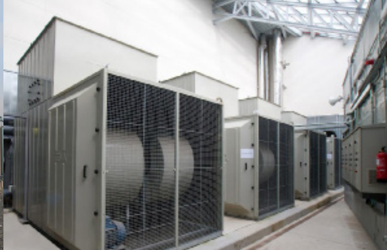
MUSEUM OF THE HUMAN EVOLUTION (BURGOS)