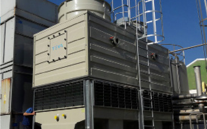
VIDRERES LLET (GIRONA) STERILIZATION - 5,500 KW